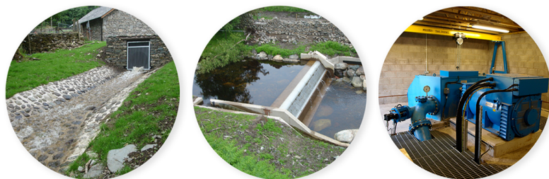
locally generated power, produced at Logan Gill hydro

Open to residents of Broughton and the surrounding areas, check online if you can benefit from Energy Local