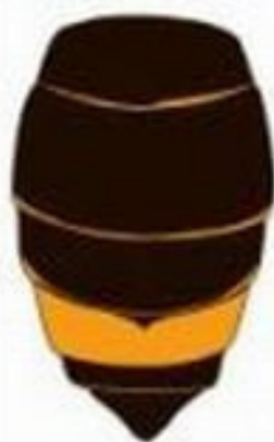
Native Hornet abdomen