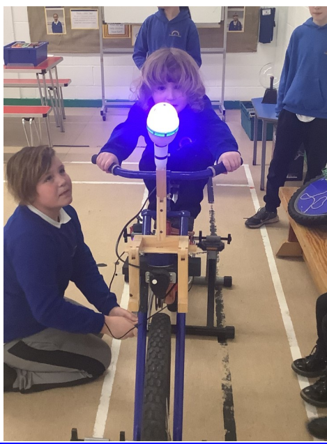
Pedal-powered lightbulb moment

To celebrate British Science Week, the wonderful Unit 3 set up a whole host of fantastic scientific equipment in the Thwaites School hall Children from Nursery to Year Six spent a day of fun and wonder learning together and were aiven the opportunity to create GIANT bubbles, make gooey coloured slime, fire rockets across the