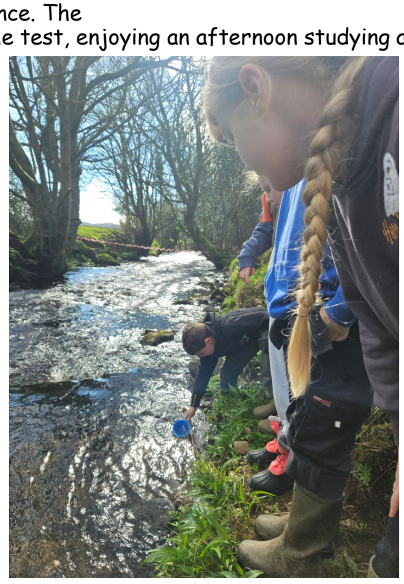
more school news overleaf .....