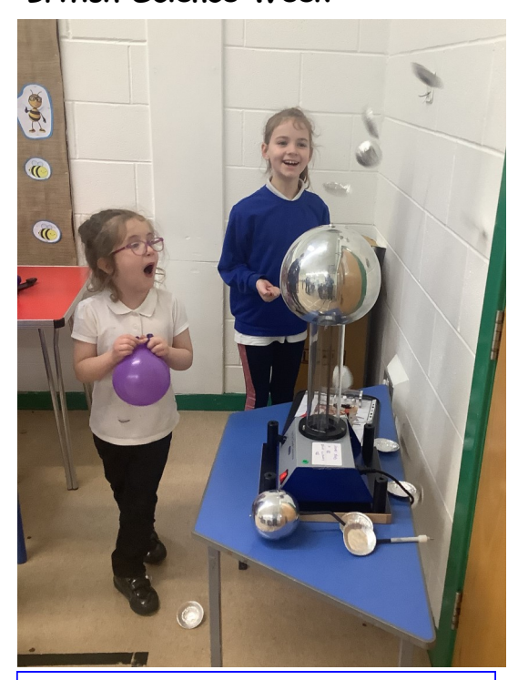
Flying foil cases with a Van De Graaff generator

To celebrate British Science Week, the wonderful Unit 3 set up a whole host of fantastic scientific equipment in the Thwaites School hall Children from Nursery to Year Six spent a day of fun and wonder learning together and were aiven the opportunity to create GIANT bubbles, make gooey coloured slime, fire rockets across the