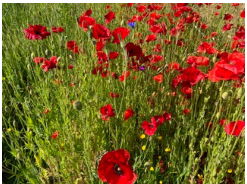
After: Wildflowers - good for people and pollinators