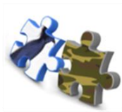
Forward Assist Recruitment